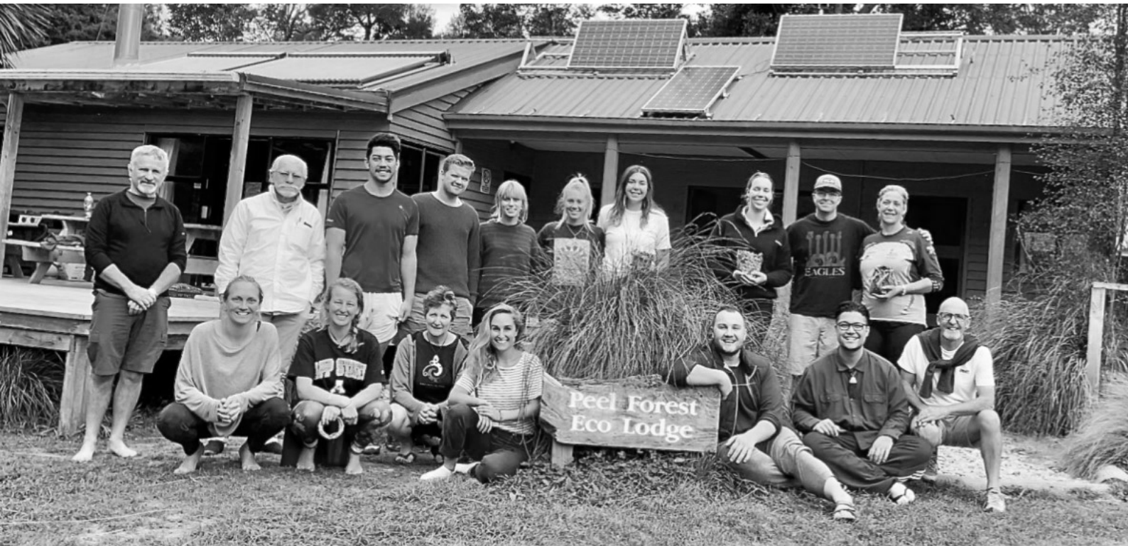
ALP 4: March 2021.