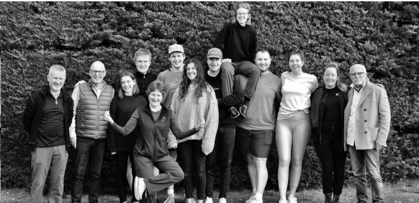
ALP 3: August 2020.